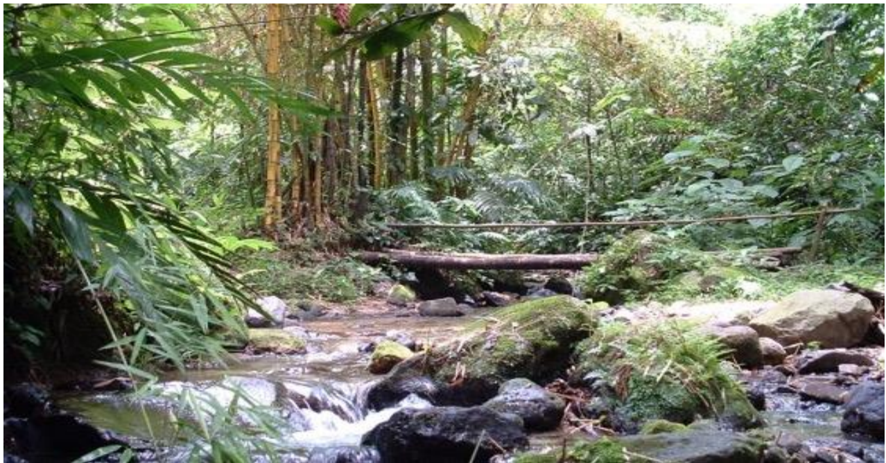
Accommodations at the Hotel La Posada (B,L,D)

We then depart in the afternoon for Coban, the main city of the Alta Verapaz department. The area is characterized by lush forest habitat. It is here that the Monja Blanca orchid grows — the national flower of Guatemala. This is one of the regions with the highest density of indigenous people, mainly Q'echi. The beauty of the fabrics, the ceramics, and the quality of the coffee make this region famous.