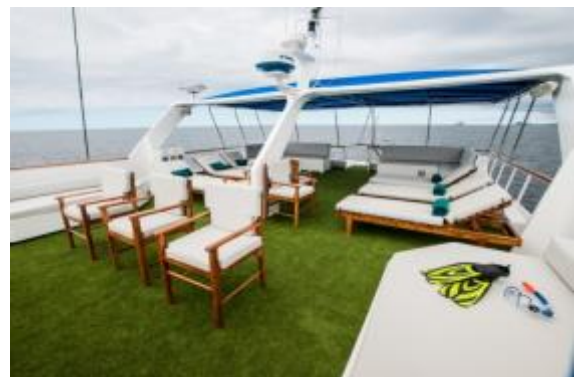
Photo: The Upper Deck, great for lounging between islands, and magical at night with the stars!

We end our cruise of the world’s most famous archipelago this morning with a visit to the Interpretation Center opened on San Cristobal Island in 1999. Here we gain a more complete understanding of the natural and human history of the Islands. Afterwards, we spend some time in port before heading to the airport for our flight back to the mainland departing at noon.