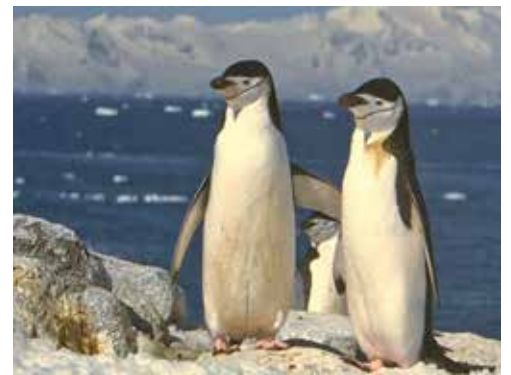
From Ushuaia, with local guides & Greg Smith

Our voyage coincides with the arrival of the Austral spring as the region emerges from winter — it is an exceptional time to visit, beloved by photographers for the fresh, white snow.