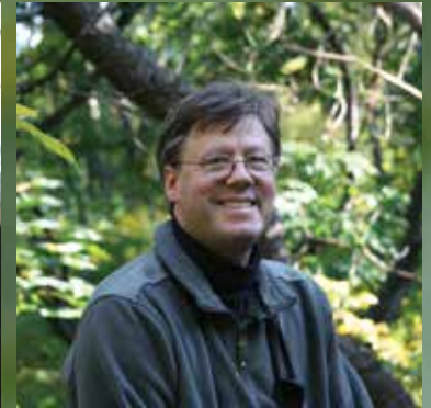
David Allen Sibley, Author, Illustrator & Ornithologist