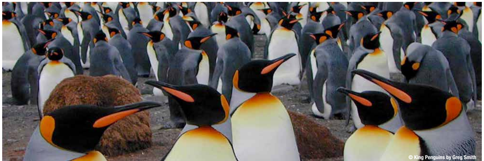
© King Penguins by Greg Smith