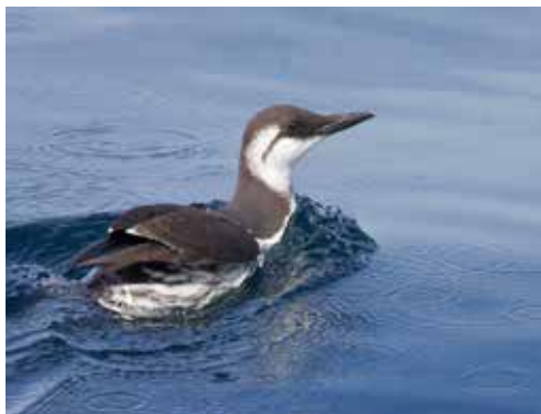
From Louisbourg, with local guides & Peg Abbott

Immerse yourself in stunning landscapes, colorful towns, and charismatic birds and wildlife along the way. Each day brings adventures and a chance to go ashore for hikes and other exploring.