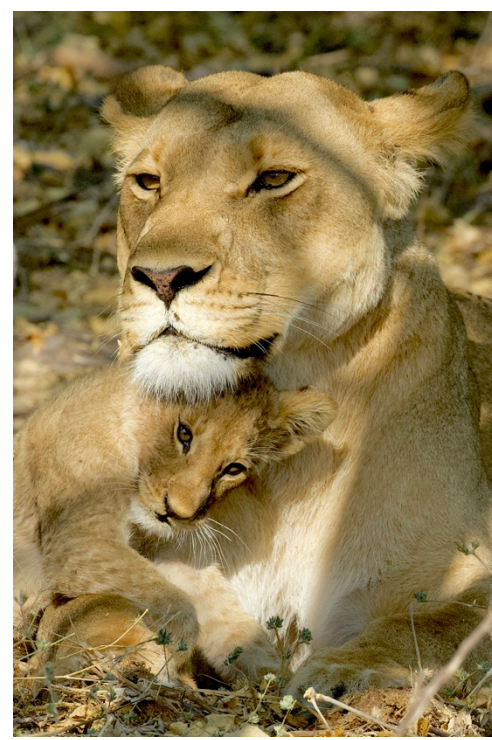
Tues., Aug. 3 – Thurs., Aug. 5 Kalahari Desert at Nxai Pan

Botswana is very well organized for getting around by air, we book you on a short flight from one lodge to the next, a wonderful way to make the most of our field time. After a morning outing we head to the airstrip, then greet the wonderful guides from our next lodge as we head to lunch there. Your first experience of the Kalahari and its vastness is from the air.