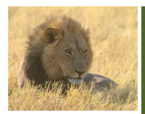
July 31 – Aug. 17, 2021

866.900.1146 800.426.7781 520.558.1146 naturalistjourneys@gmail.com www.naturalistjourneys.com or find us on Facebook at Naturalist Journeys, LLC