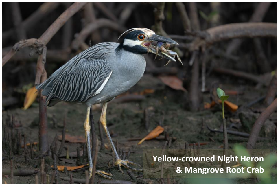
Yellow-crowned Night Heron & Mangrove Root Crab