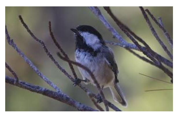
Sun., Sept. 2 Keweenaw: Copper Harbor / Hunter Point / Brockway Mountain Drive

We woke in our cozy log cabin accommodations to crisp air suggesting fall. Some of the group took off on a nature hike with Mary Jane, on a trail close to the lodge. They had a grand time identifying local shrubs and wildflowers, and scoping out the forest.