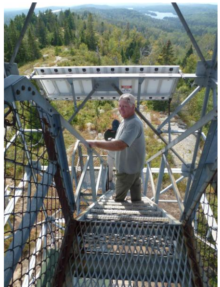
Thurs., Sept. 6 Canoes on Tobin Harbor / Hidden Lake to Lookout Louise on Greenstone Ridge / Afternoon boat to Edisen Fishery, the Isle Royale Wolf Project headquarters, and the Rock Harbor Light.

a poll as to when the three would return. All were glad when the trio emerged from the forest, heading directly to the bar for pizza and bear, as sun tucked in for the day and night fell.