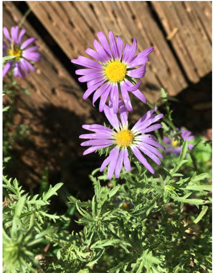
Monsoon wildflowers we saw: Firecracker Bush (Bouvardia ternifolia), a member of the Coffee Family that's a favorite with hummingbirds, and Tansyleaf Aster (Machaeranthera tanacetifolia)