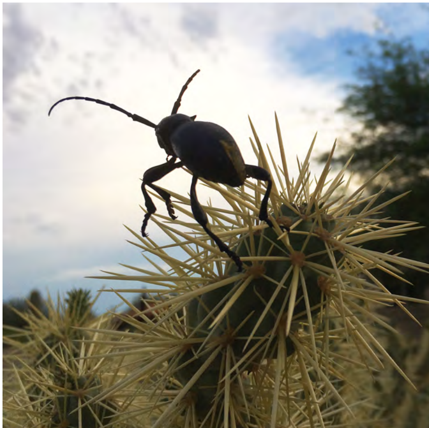
Cactus Long-horned Beetle (Moneilema gigas)

After lunch we drove east into looming monsoon thunderheads toward Whitewater Draw state wildlife area, our only real opportunity to see wading birds during the trip. It was getting late in the day, but we did find a swimming Sora, Lesser Yellowlegs, Cinnamon Teal, Ruddy Ducks, White-faced Ibis, and American Avocets (the latter seen at a great distance).