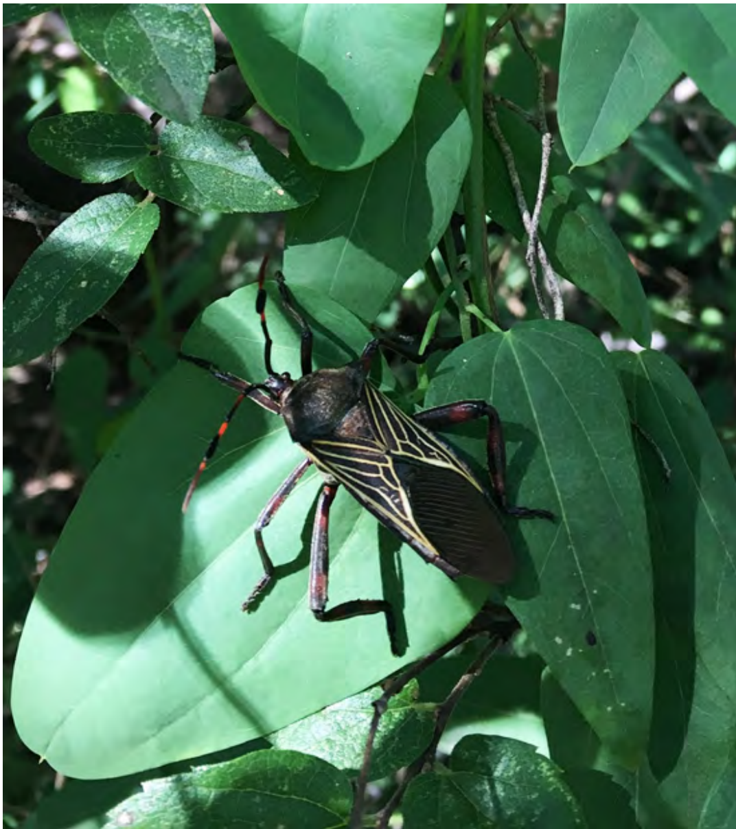
Bug of the trip: Giant Mesquite Bug (Thasus neocalifornicus)--hard to believe they don't bite! Scale = Life Size

We'll await the final tally, but somewhere in the vicinity of 150 birds were seen on the trip, a very respectable total for 6 days in SE Arizona.