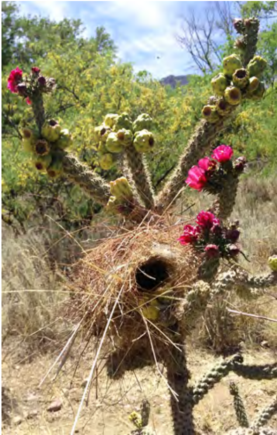
Cactus Wren nest

We also stopped for a few minutes at a group of homes we'd visited earlier in the day, in hopes of seeing some Scaled Quail that had been reported there. We whiffed on the quail, but did end up with a nice Cactus Wren, which had oddly managed to elude us thus far on the trip. The mesquite grassland habitat here also supported Blue Grosbeak and Lark Sparrow.