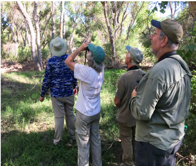
Stalking the Rose-throated Becard

We stopped for lunch in Green Valley (Italian), and then drove south to Tuma-cácori and walked the Anza trail, to give the rest of the group the chance to see the Rose-throated Becard. The birds were not nearly as cooperative as the previous day, and the group waited some time before finally getting a decent glimpse at the nest. Birds recorded on the walk in and out included Dusky-capped Flycatcher, Verdin (their insistent chip was hard to miss), a bright male Summer Tanager, Black Phoebe, Bridled Titmouse, Bell's Vireo, Abert's Towhee, Gila Woodpecker, Greater Roadrunner, and a singing Yellow-breasted Chat.