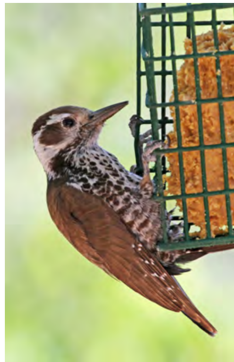
Arizona Woodpecker