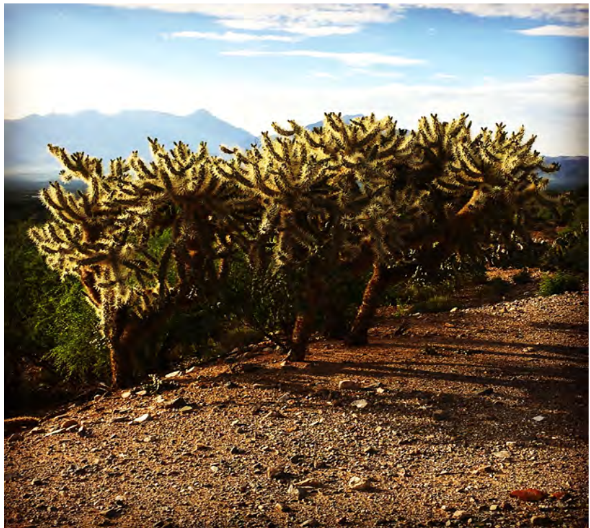
Jumping cholla (Cylindropuntia fulgida) and the Santa Rita Mountains in the background

After breakfast we stopped again at the nearby water treatment pond, and the accidental Brown Pelican remained, having moved perhaps 3 feet from its perch of the previous day. We also picked up Neotropic Cormorant, as well as the earlier seen duck species. We then drove north and east to explore Madera Canyon in the Santa Rita Mtns. On the drive up we stopped in mixed mesquite-cactus habitats, with several Cholla and Prickly-Pear species. Rufous-winged sparrows were again abundant, as well as Loggerhead Shrike, Cassin's and Lark Sparrows, and Vermillion Flycatchers. The unusual Unicorn Plant ( Proboscidea althaeifolia ) was blooming along the roadsides.