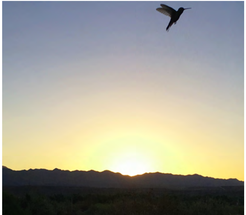
A first-of-the-morning Black-chinned Hummingbird heads for the feeders at the Amado Territorial Inn