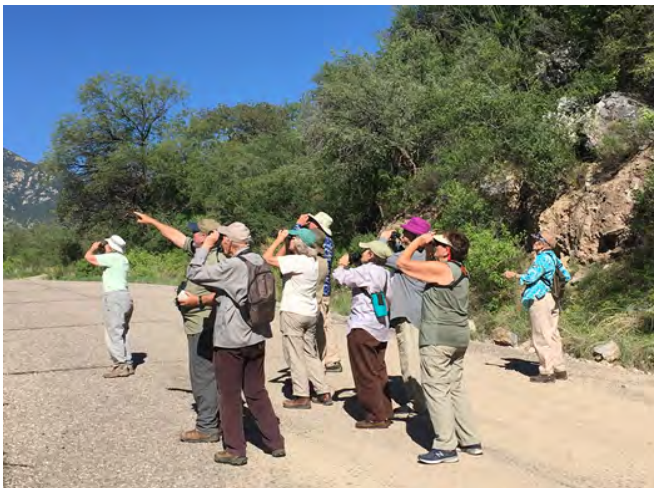
Birding Montosa Canyon

We had a short walk down to the Santa Cruz riparian zone, which was dominated by Fremont Cottonwood ( Populus fremontii ) and Arizona Sycamore ( Plantanus wrightii ). Within half an hour we'd pinpointed the active Becard nest, high in a cottonwood, where it hung suspended like a football-shaped piñata. Both male (with rose throat fully visible) and female birds were present, and we had good views. A nearby pair of Brown-crested Flycatchers was also nesting, and the birds were raiding the Becard nest for their own construction materials. Other species here (and on the walk in) included Western and Cassin's Kingbirds, Bell's Vireo (very vocal), Blue Grosbeak, Gila Woodpecker, Abert's Towhee, Lesser Goldfinch, Bewick's Wren, and Chihuahuan Raven, among others. Regrettably, we (and everyone else that morning) struck out on the Vireo, which in any case would have been a real bonus if we'd found it.