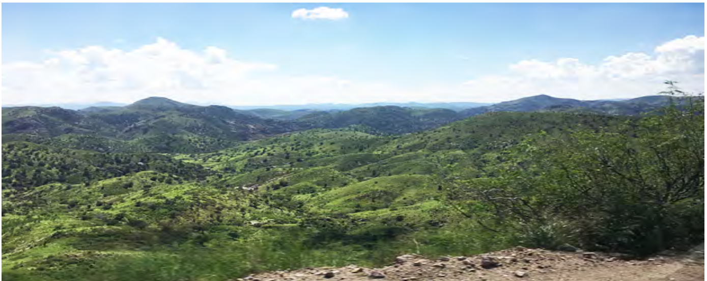
Heading into California Gulch, west of Nogales