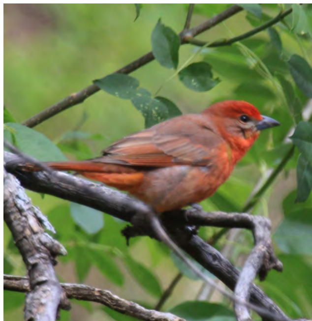
Hepatic Tanager

The narrow road up to Carr is loaded with switchbacks, and it was difficult for the drivers to do anything but watch the road! But that paid off as we neared the top, when those in both vehicles got great views of two adult White-nosed Coatis crossing the road just ahead. They then perched on the bank above the vans as we approached, and sat there staring. Best mammal of the trip. Once up top, we made our way to the Reef Townsite Campground to search for yet another of the recent rarities that have lately made their way to SE Arizona from Mexico, the Tufted Flycatcher.