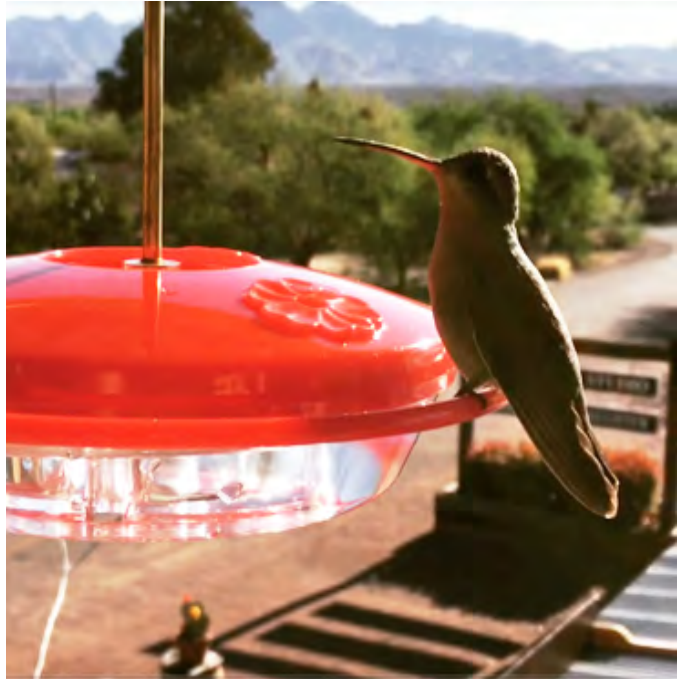
Female Broad-billed Hummingbird

We stopped next at the terminus of the Madera Canyon Road, and checked out the picnic area there. Yellow-eyed Juncos made their initial appearance of the trip here, as well as Ladder-backed Woodpecker, and White-breasted Nuthatch. But overall it was quiet. On the way down we stopped at the unique Kubo B & B, and saw our first Painted Redstart at their feeders.