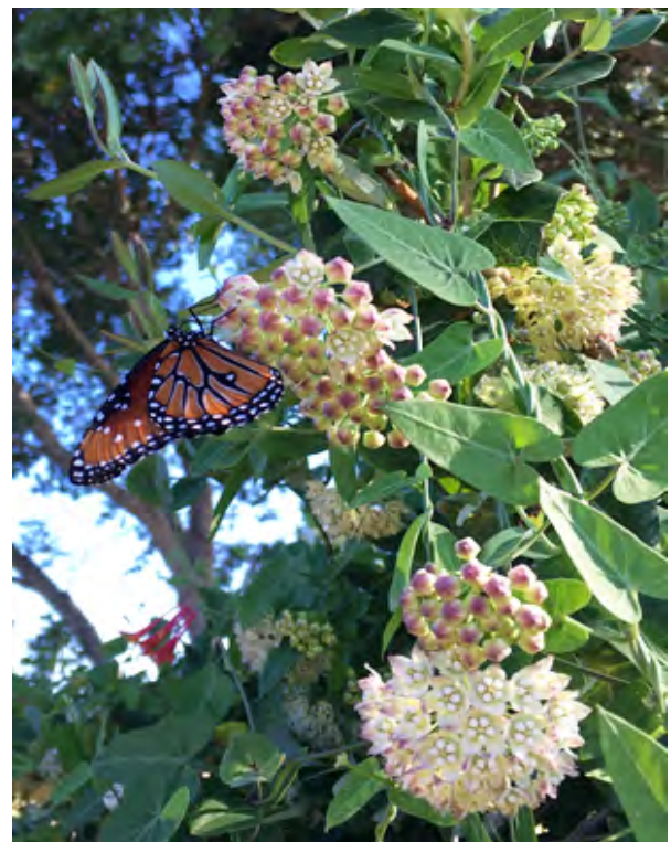
A Queen butterfly ( Danaus gilippus) visits its host plant, the Climbing Milkweed ( Funastrum cynanchoides)