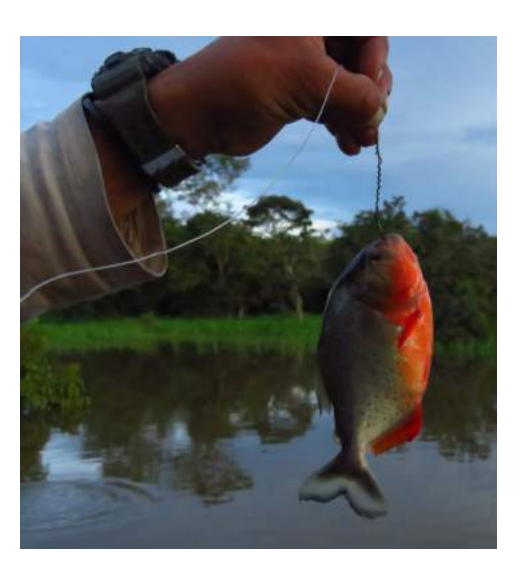
Day 7 (Thursday, November 8): Kayaking on Supai Creek, visit to San Jose Paranapura

fact-filled lecture on favorite Amazon birds including Hoatzin, Black-collared Hawk, potoo, toucans, Barred Antshrike and Yellow-rumped Cacique. During the afternoon the Zafira headed back downstream to the Ucayali River, retracing our navigation over the last couple of days. Then at 4 pm the group split into those going birding and fishing, and those just birding, and we zoomed out on the skiffs again. Heading four miles up El Dorado Creek, we encountered Spotbreasted Woodpecker, Red-capped Cardinal, Capped Heron, Orange-backed Troupial, Black-tailed Trogon and more Green Kingfishers. The fisher-people had good luck catching hefty Red-bellied Piranha, which the rest of us enjoyed for dinner, after another round of music with our on-board band as the Zafira continued to navigate downstream.