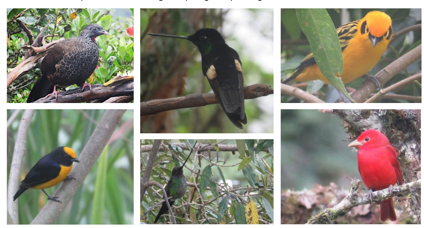
Monday, November 19 Yanacocha Reserve, Tandayapa Road, Nanegalito We traveled north through the city of Quito heading toward the renowned Yanacocha Reserve, high in the Ecuadorian cloud forest. We spent the morning walking the trails and watching the feeders. One bird we were keen to see at this high altitude location was the Sword-billed Hummingbird. We weren't disappointed as we spotted this hummingbird — the only bird that has a bill longer than its body — hovering at a feeder. We found eight, high-elevation hummingbirds coming to the feeders, as well as, the colorful Scarlet-bellied Mountain Tanager, a pair of Andean Guans, and Gray-browed and Yellow-breasted Brushfinches.

Those of us that remained in Ecuador to bird the Mindo area returned to our local Quito hotel to enjoy another delicious meal and spend a restful evening anticipating our upcoming adventure.