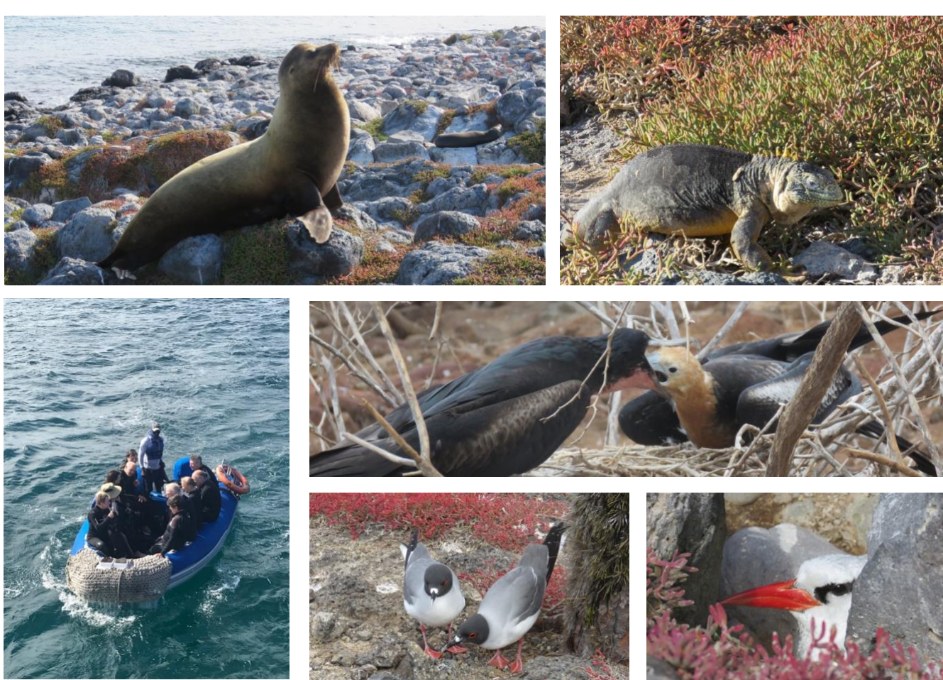
Saturday, November 17 South Plaza Island & North Seymour

Sharks, Hammerhead Shark, Diamond Stingrays, and perched Lava Herons. The serenity of this sheltered habitat, and the close views of nature it provided, was breathtaking!