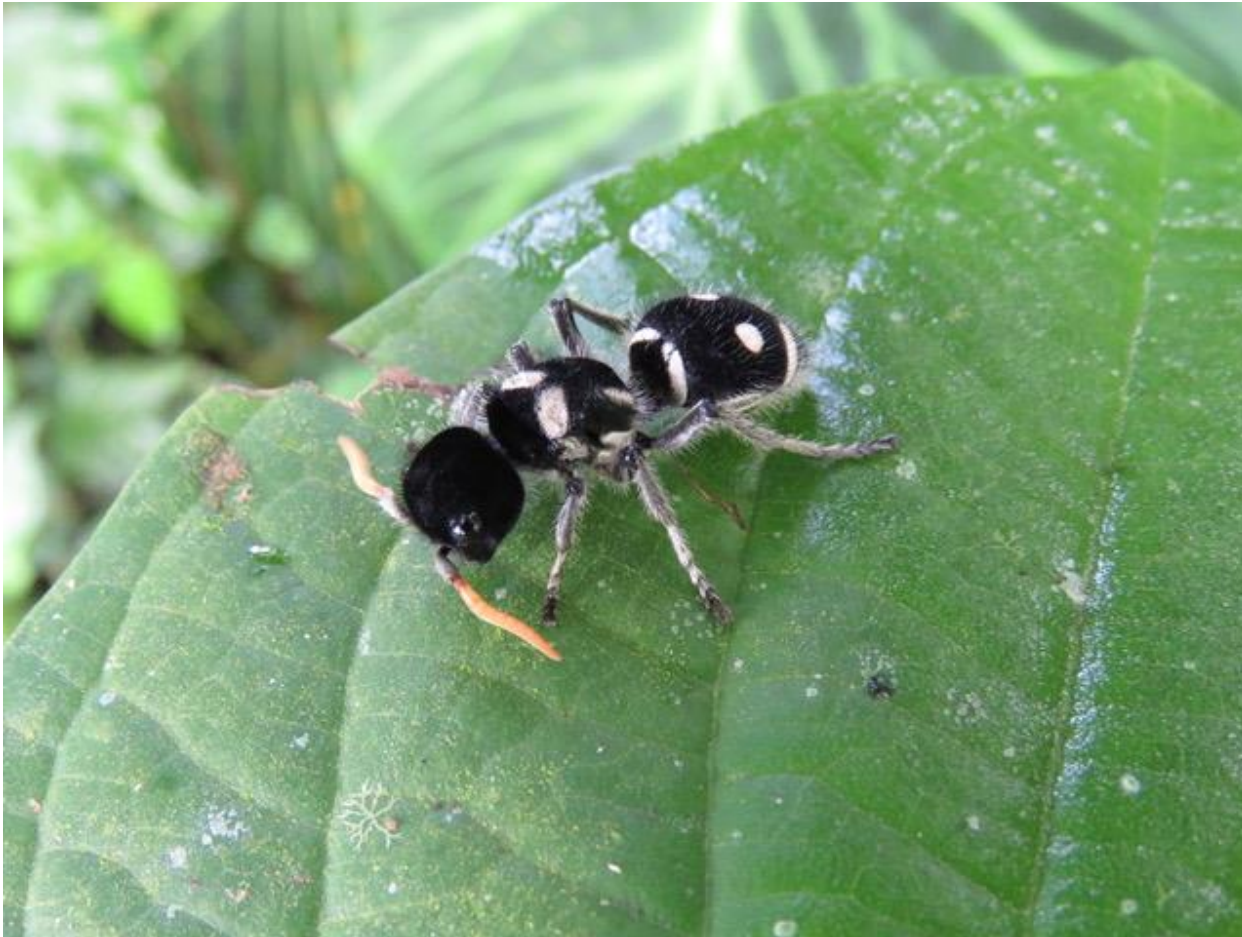
Velvet Ant, Photo by Howard Topoff

Naturalist Journeys, LLC / Caligo Ventures PO Box 16545 Portal, AZ 85632 PH: 520.558.1146 / 866.900.1146 Fax 650.471.7667 naturalistjourneys.com / caligo.com info@caligo.com / naturalistjourneys@gmail.com