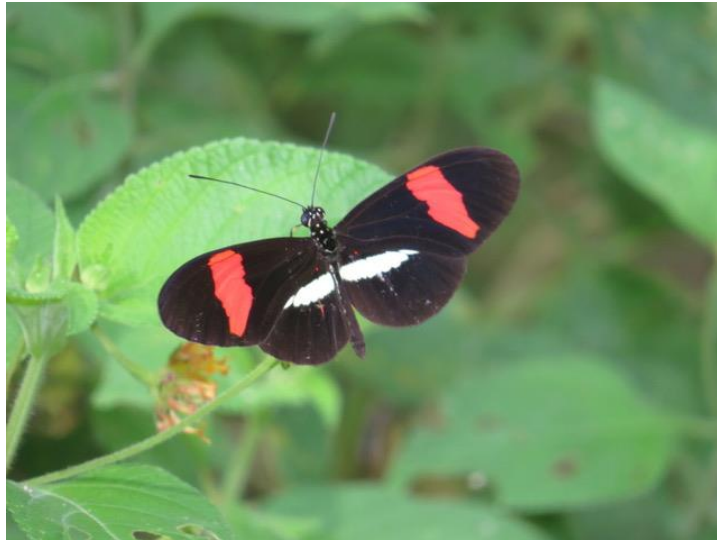
Long-wing Crimson-patched Butterfly, Photo by Howard Topoff

Naturalist Journeys, LLC / Caligo Ventures PO Box 16545 Portal, AZ 85632 PH: 520.558.1146 / 866.900.1146 Fax 650.471.7667 naturalistjourneys.com / caligo.com info@caligo.com / naturalistjourneys@gmail.com