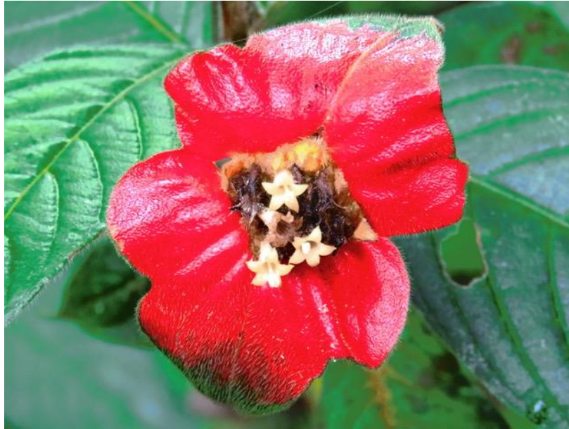
Geoffroy's Tamarin, Canopy Tower