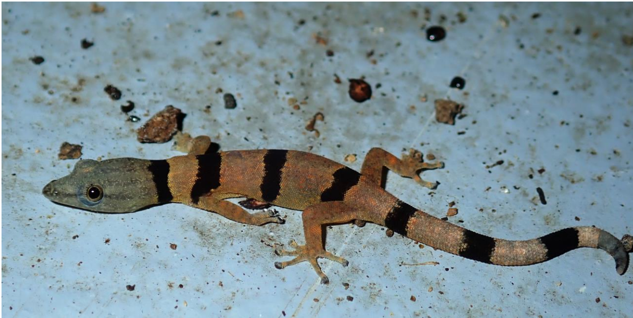
Caribbean Least Gecko, Photo by Hsin-Chih Perng

Naturalist Journeys, LLC / Caligo Ventures PO Box 16545 Portal, AZ 85632 PH: 520.558.1146 / 866.900.1146 Fax 650.471.7667 naturalistjourneys.com / caligo.com info@caligo.com / naturalistjourneys@gmail.com