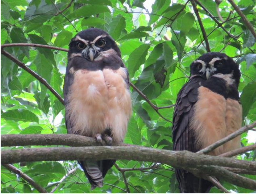
Cathie at Summit Gardens, Photo By Howard Topoff