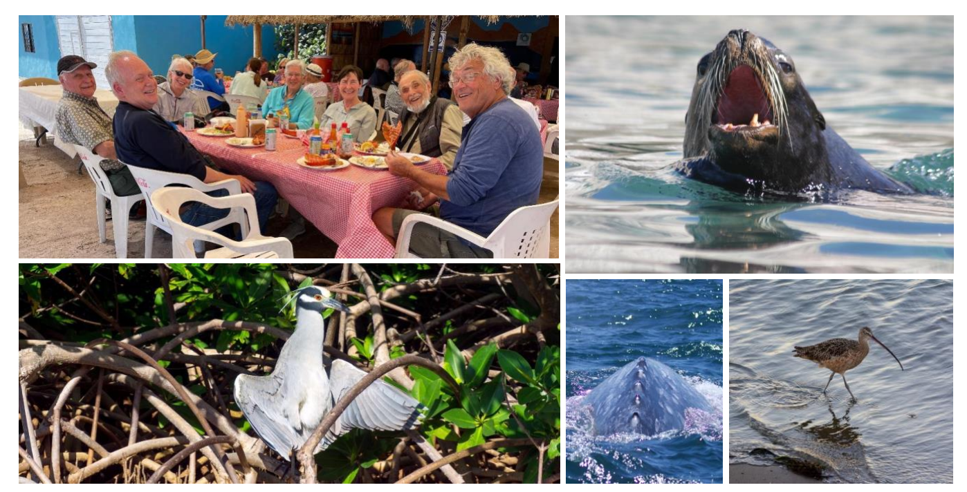
Fri., Mar. 11 Puerto Chale

This was the morning we had been hoping, no, not because it would be our last full day, but because we were going to head to the southernmost location for gray whales! A day that could easily add close to fifteen additional species to our list. So, we were off the boat by 0730 and onto a bus heading north. Not much in the way of birds as we moved north, but as soon as we were in our life jackets and standing on the edger of the mangrove-lined channel, we started getting new birds. Yellow-crowned Night-Heron, Willet, Long-billed Curlew, White Ibis and more. But it was time to go whaling, and off we went. We had Neotropic Cormorant, Elegant Tern and then the whales. Probably about six different individuals that would swim alongside of us for minutes on end. Surfacing and blowing with the mist sometimes landing on us. After about forty minutes, they disappeared as quickly as they had shown up. We moved over to the tip of the sandspit where there a huge flock of birds, mostly Brandt's Cormorants and Brown Pelicans, but there were enough gulls mixed in to making it very interesting!