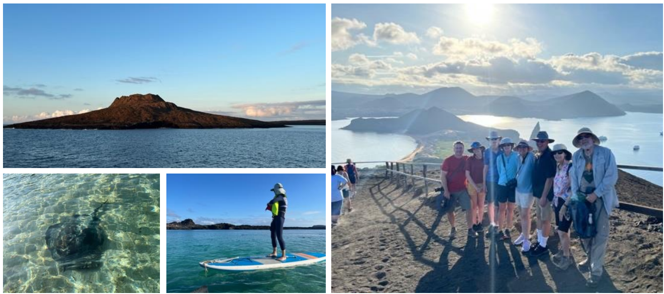
reserve we were amazed to have a Galapagos Rail appear in the road in front of the bus. While not the rarest bird, it is perhaps one of the most elusive birds in the Galapagos. We were thrilled to have it walking around for 30 seconds or so.

After lunch on the Origin, we were back in our pangas heading back to Puerto Ayora to visit the Charles Darwin Station and Galapagos National Park Headquarters. Here we learned about the breeding program here for all the various subspecies of Galapagos Tortoises and the conservation programs to reintroduce them to their original habitats. While there's still much work to do, the success stories of reestablishing native wild breeding populations on some of the islands where these giants were extirpated was heartwarming. The rest of the afternoon we were on our own to explore the town of Puerto Ayora. It's a larger town with plenty of shops, cantinas, and restaurants. The birding is good here too, especially around the marina and local beaches. We meet up in the marina and board our pangas to get back to the Origin for dinner.