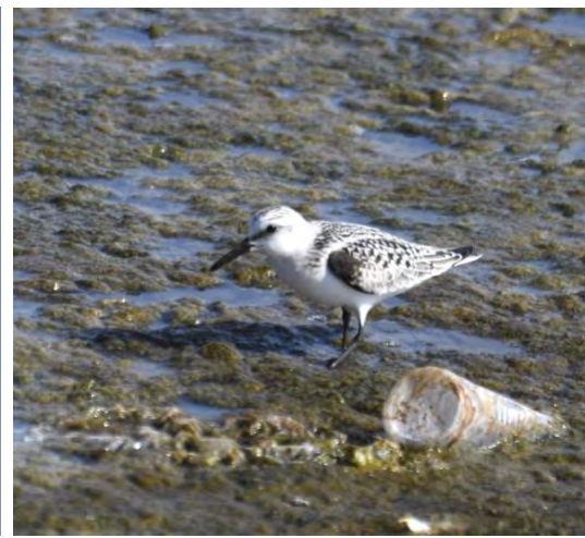
Fri., Sept. 22 Kraymorie | Pomorie salt-lakes | Thracian Mound at Pomorie | Nessebar | Lake Atanasovsko

This morning we first visited sites around Pomorie, a seaside town that historically was inextricably linked to the production of salt. At first, we explored two large reed-fringed lakes just outside town. Two Eurasian Penduline-